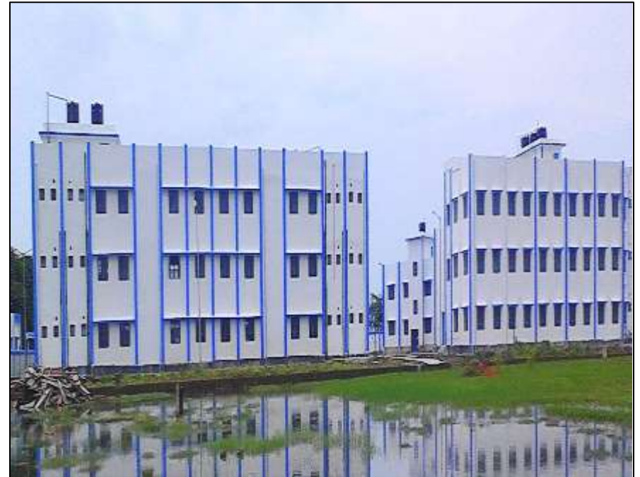
Higher Secondary School