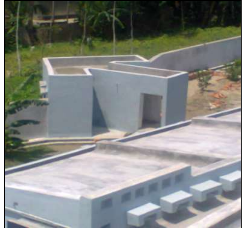
West Bengal BOPs'