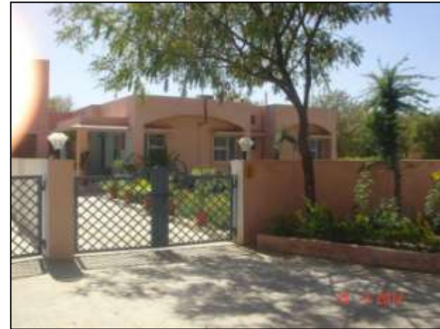
Colony at Binani Cement, Rajasthan