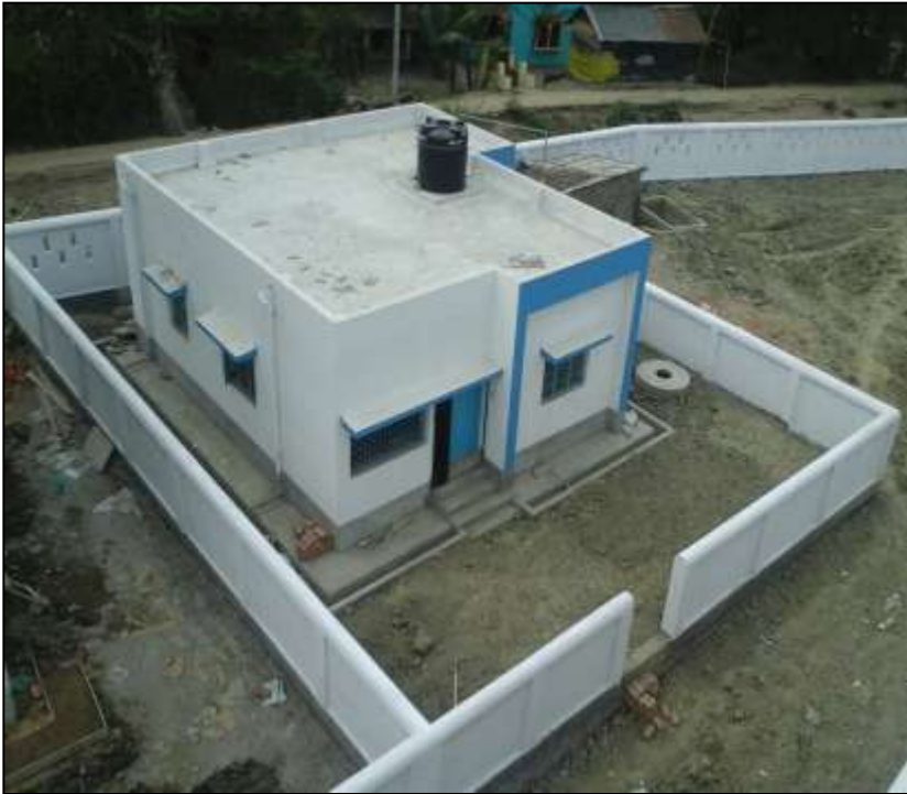
Head Master's Quarter