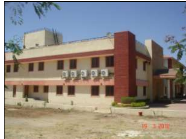
Colony at Binani Cement, Rajasthan